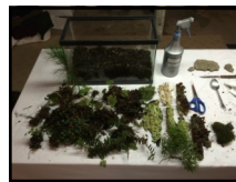
"Woodland plants, lichens and fungi for planting"

Using your tablespoon, "dig" a hole large enough to accommodate the plants. Start with your "trees" first. Place them upright in the hole and firm the soil mixture enough to support your plants in an upright position. Do your herbaceous plants next. No rules here, enjoy being "God the Creator"! Lightly water the plants once planted; I'm talking a couple ounces of water here for all of them. Remember that there are no drainage holes in your container and if you saturate the soil, your plants will most likely die. The goal is to have a damp, slightly moist environment and that condition will be largely accomplished by periodic spritzing of the foliage and moss. With the glass covering the top of the container, the soil will most likely not dry out over the winter months. Add your lichens and pieces of bark and a red elf if you found one. of tiny insect.