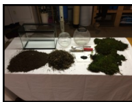
Materials for terrarium

Line the bottom and sides of your terrarium with the sheet moss. Mix 3 parts potting soil with 1 part leaf duff with no more than a tablespoon of your charcoal. Take a "spritzer" bottle and dampen the soil mix. Add about 3" – 4" of the mixture to the bottom of the terrarium. You can cut excess sheet moss from the sides and retain it to fill-in between your plants.